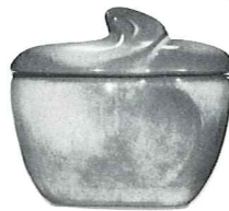
4B—SUGAR WITH LID 4.50