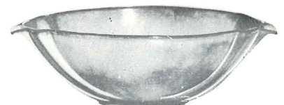
*201—9" BOWL — 4.25