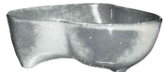
*4N—24 OZ. VEGETABLE 4.25