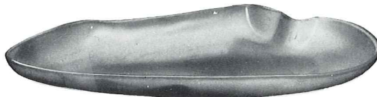
*4P—13" PLATTER 7.00