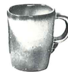
*5CC—5 OZ. TEACUP — 2.50