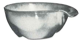
*4X—14 OZ. CEREAL 3.00