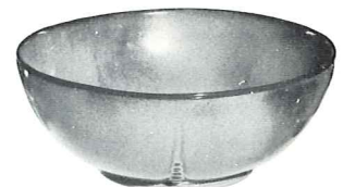
*224—8" ROUND BOWL 6.00