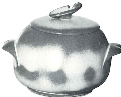
*4W—3 QT. BAKER/BEAN POT — 12.00 *4W/W—BAKER/W WARMER SET — 18.50