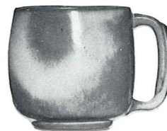
*4M—18 OZ. MUG 4.00