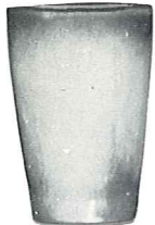
*5L—12 OZ. TUMBLER 3.50