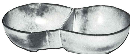
*4QD—11" DIVIDED BOWL 7.00