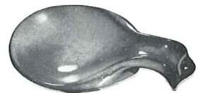
*4Y—6" SPOON HOLDER 3.00