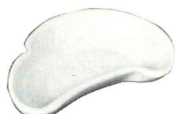
*243—BONE DISH—6½" 2.50