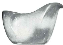
4A—8 OZ. CREAMER 3.00