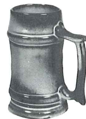
*M2—18 OZ. STEIN 4.00